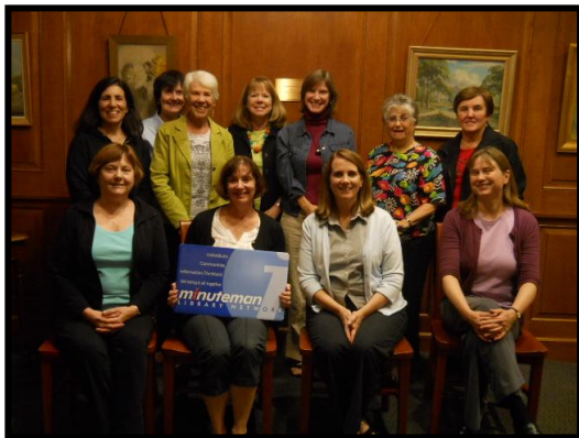
The Friends of the Goodnow Library have their library card – do you?

It's good to have Friends! This year, the Friends supported programs for children, paid for our copiers, and of course, funded our hugely popular museum pass program. Not only that, but they contributed $7,000 towards the purchase of e-books for the library, allowing patrons greater access to free downloadable digital audiobooks and e-books. They continued their great work on our front gardens, hosted the Volunteer Luncheon and held another successful book sale. In December, the Friends became an Amazon.com Affiliate. This means that by shopping at Amazon via the library website a small commission on the items you purchase will be sent to the Friends.