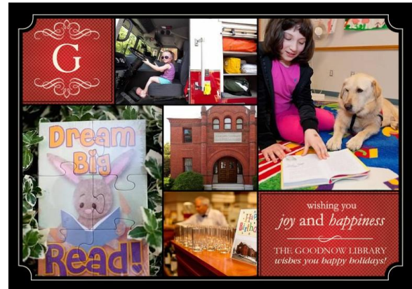
2012 Holiday card

"I love the welcoming, friendly staff. It is always nice to have a chat-- I don't like libraries that are super quiet and don't like people talking--I think the library should be a social place." --Community Survey Respondent