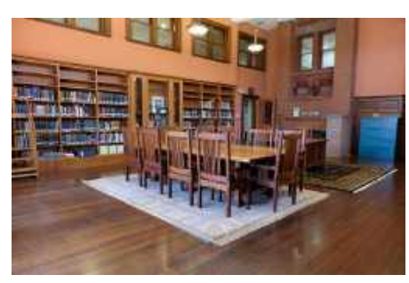
Goodnow is a place for quiet learning...

Although the Library is currently shuttered, it remains a hub of information, ideas, and innovation through greater accessibility to online resources and creative virtual activities. In a recent project, the Library and the Foundation partnered to sponsor a reading challenge – Goodnow Reads for a Good Cause – that raised funds for HOPEsudbury. This collaboration encouraged reading for all ages, while helping our neighbors in need.